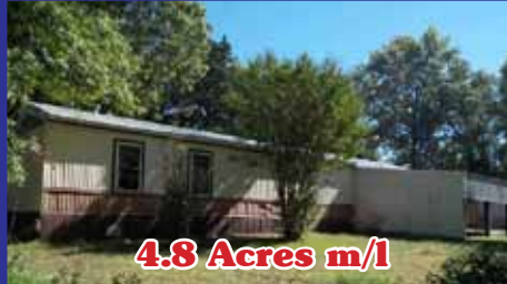
4.8 Acres m/l

Secluded acreage, pond, partial Truman Lake view. Close to several boat access areas. 3 storage buildings. MLS#71088 $50s