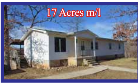
17 Acres m/l

28595 LakeLoop - Lincoln 3 Bdrm, 2 Bath Home on Lake of the Ozarks, 220 ft of water frontage with breathtaking views. Above ground pool, so much more! MLS#70921 $109,900