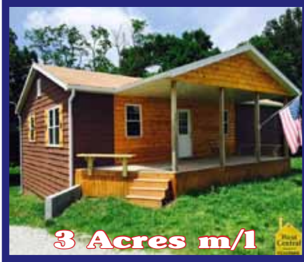
3 Acres m/1

173 S Hwy 7 3 BR, 2 Bath MLS#72488 $106,000