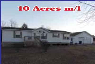
10 Acres m/l

Neat & Clean 3 BR, home nestled on a shaded lot on almost an acre. 2 storage sheds & 2 car carport. 2 decks, newer A/C. Lots of wildlife and access a private lake. Close to Truman Lake MLS#71368 $50s