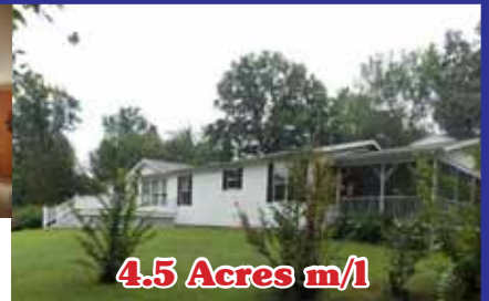
4.5 Acres m/l

All electric 3 BR, 2.5 Bath home on partially timbered secluded acreage 1.5 miles from Windsor Crossing & Truman Lake. Large rooms, full WO basement. Thermopane windows. Large deck & screened-in porch. Great for family or lake home get-away! $130s