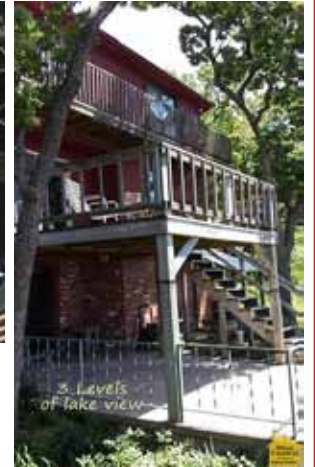
3 Levels of lake view