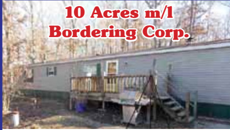
10 Acres m/l Bordering Corp.

Secluded acreage, pond, partial Truman Lake view. Close to several boat access areas. 3 storage buildings. MLS#71088 $50s