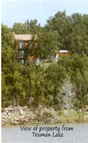
View of property from Truman Lake