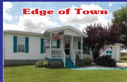
Edge of Town

Nice well-maintained bungalow on the edge of town, bordering Corp Ground. 2 garden sheds, metal bldg w/concrete floor & electricity. Comes with all the furnishings. Sold "as is". $30s