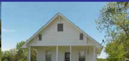
Your Getaway Retreat

Nice well-maintained bungalow on the edge of town, bordering Corp Ground. 2 garden sheds, metal bldg w/concrete floor & electricity. Comes with all the furnishings. Sold "as is". $30s