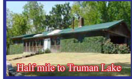
Half mile to Truman Lake

501 S 3rd St - Clinton 2 Bdrm, 2 Bath home with huge garage. Spacious rooms with detailed wood trim and tons of character!! High ceilings and open rooms provide plenty of room for entertaining. Large deck, large laundry room and roomy master bath are just a few of the features you will want to see for yourself. Priced to sell fast. MLS#70640 $99,000